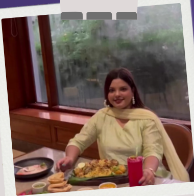
Influencer Campaign for Greenwood Resort