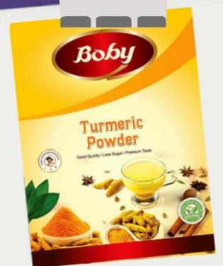
Packaging Design for Bobby