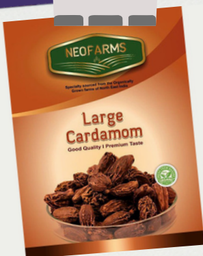
Packaging Design for Neofarms