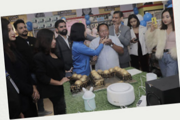
Launch Activations for WK Life