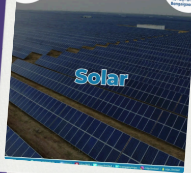
Animated Videos for NTPC