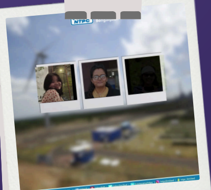
Animated Videos for NTPC