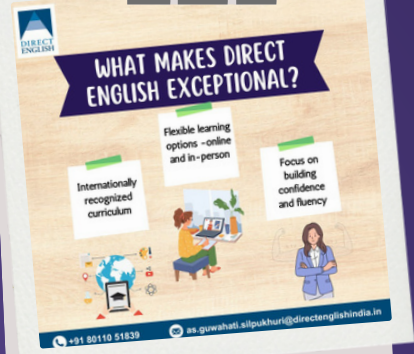
Social Media Campaign for Direct English