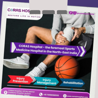
Social Media Campaign for Coras Hospital